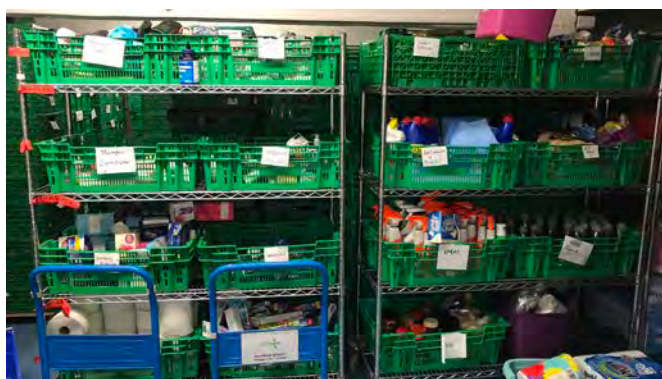
We also offer household cleaning items and toiletries

We are also so grateful for the wonderful financial donations. We love hearing the stories of fundraising from selling sunflowers and cakes to the Cirencester Creative Dance Academy choreograph competition to the Hockey Club virtually running around the world. It's inspiring to see so many different ways you are supporting us!