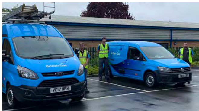
Our British Gas delivery volunteers

We have always had a huge focus on our partnerships with our referral agencies and this has and continues to be hugely beneficial as we continue to navigate through the crisis. As well as migrating all of our referral agencies onto our digital referral system, we have continued to meet (virtually!) with our close partners including Citizens Advice, The Churn Project, Cirencester Opportunity Group, Home Start and Cirencester Signpost. We've also engaged with every school in the community, the social worker teams, Cotswold District Council, the housing associations and many health professionals. The benefit of these partnerships enables us to provide greater mutual support to all of our clients.