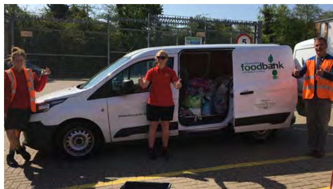
Royal Mail team in Cirencester

We are also tentatively planning ahead and looking at what the future looks like. We are learning lots as the home delivery system develops, we are monitoring usage of our digital referral system and investigating how we can deliver virtual signposting and expanding our partnerships.