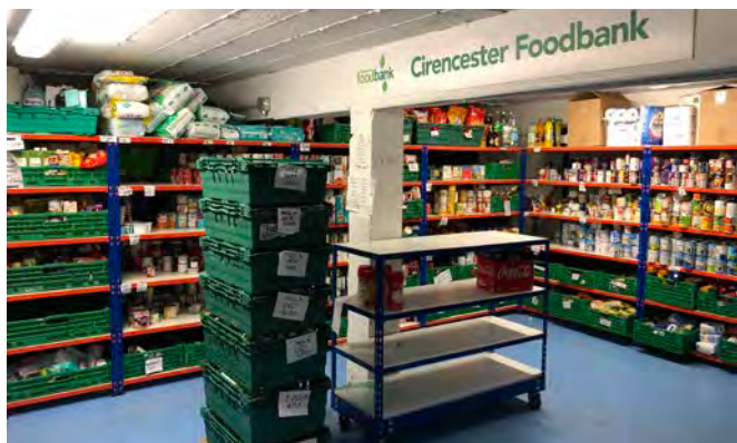
Food is sorted by type in the warehouse

We are also so grateful for the wonderful financial donations. We love hearing the stories of fundraising from selling sunflowers and cakes to the Cirencester Creative Dance Academy choreograph competition to the Hockey Club virtually running around the world. It's inspiring to see so many different ways you are supporting us!