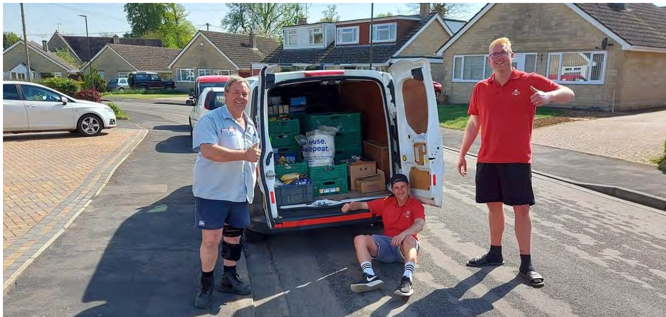
Royal Mail team in Fairford